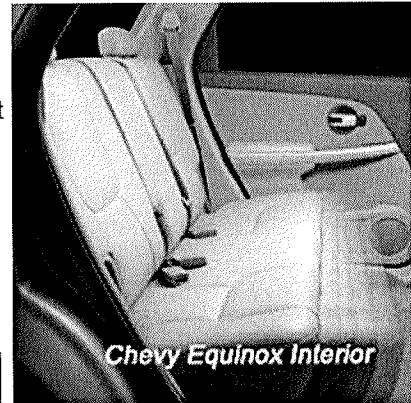
Chevy Equinox Interior

AWARDS .... The Buick Terraza, Cadillac STS, Chevy Equinox and HUMMER H3 are among the vehicles nominated for an Interior of the Year award, part of the 12th annual Auto Interiors Show being held May 18-19 at Cobo Center in Detroit. Nominees were selected by the editors of Ward's Auto World magazine, based on overall styling, functionality, quality, fit and finish, convenience and special features, and will be voted on by members of the North American automotive news media as well as the industry at-large. The winners will be announced May 18.